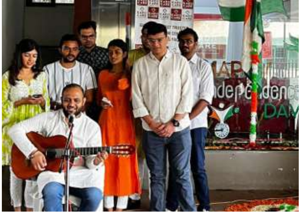
15 AUG, 2023

The first project of RCVS for the rotary year 2023-2024. Umbrellas were distributed on the to the families living across the streets near Nilambercircle and Diwalipura.